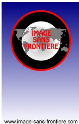
IMAGE SANS FRONTIERE IMAGE WITHOUT FRONTIER BILD OHNE GRENZE BEELD ZONDER GRENS IMAGEN SIN FRONTERA IMMAGINE SENZA FRONTIERA pour la promotion de l'image photographique de qualité for the promotion of quality photography